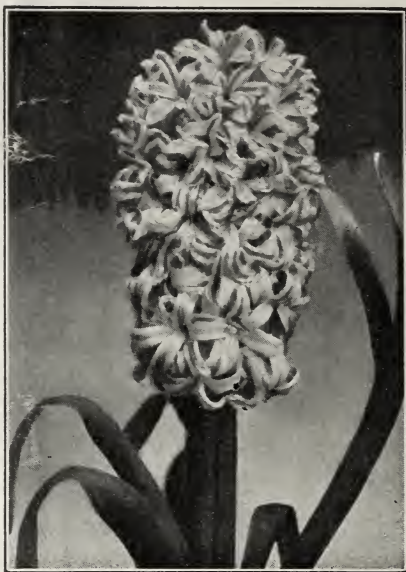
Hyacinth, King of the Blues

Orders for 6 of a kind filled at dozen rates.